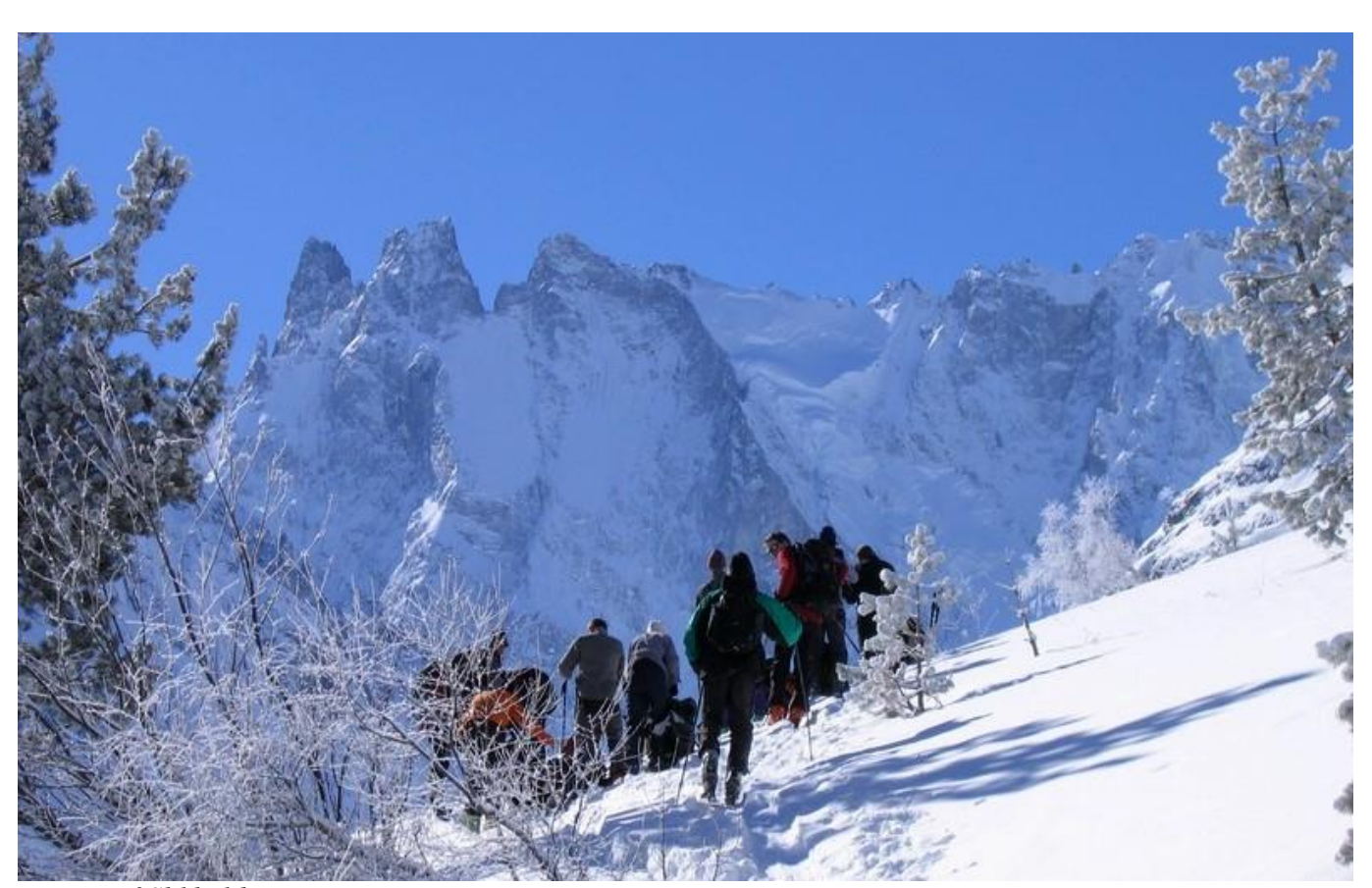
Beauty of Shkheldy-tau