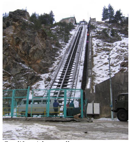
Day 1, 17/03 Flight to Mineralnie Vody airport, arrival at noon. Transfer to Adyrsu valley, to the hut Ullutau, 2350m. Refuge 2, 3, 4, 5-bed rooms, shower, WC on the floor.