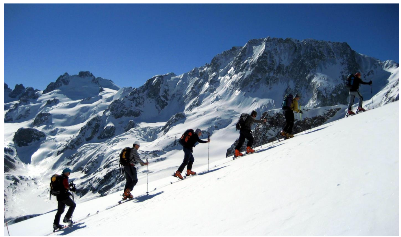
Up to Chotchat in front of Ullutau peak, far left Granovskogo pass

Day 6, 22/03 Ski tour over the pass Gumachi, 3600m with climb to peak Gimachi, 3850m. The descent into Adylsu valley to the Mountaineering Camp Elbrus, 2050m. Refuge 2, 3, 4 bed room, shower, WC on the floor.