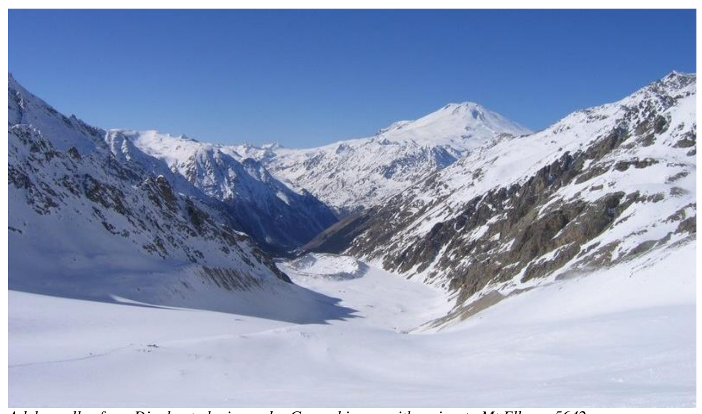
Adylsu valley from Djankuat glacier under Gumachi pass with a view to Mt.Elbrus, 5642m

Day 7, 23/03 Ski tour to Kashkatash glacier then to Turiy (Ibex) lake 3000m; or to the foot of Ullukara peak 4308m Descent to the MC Elbrus.