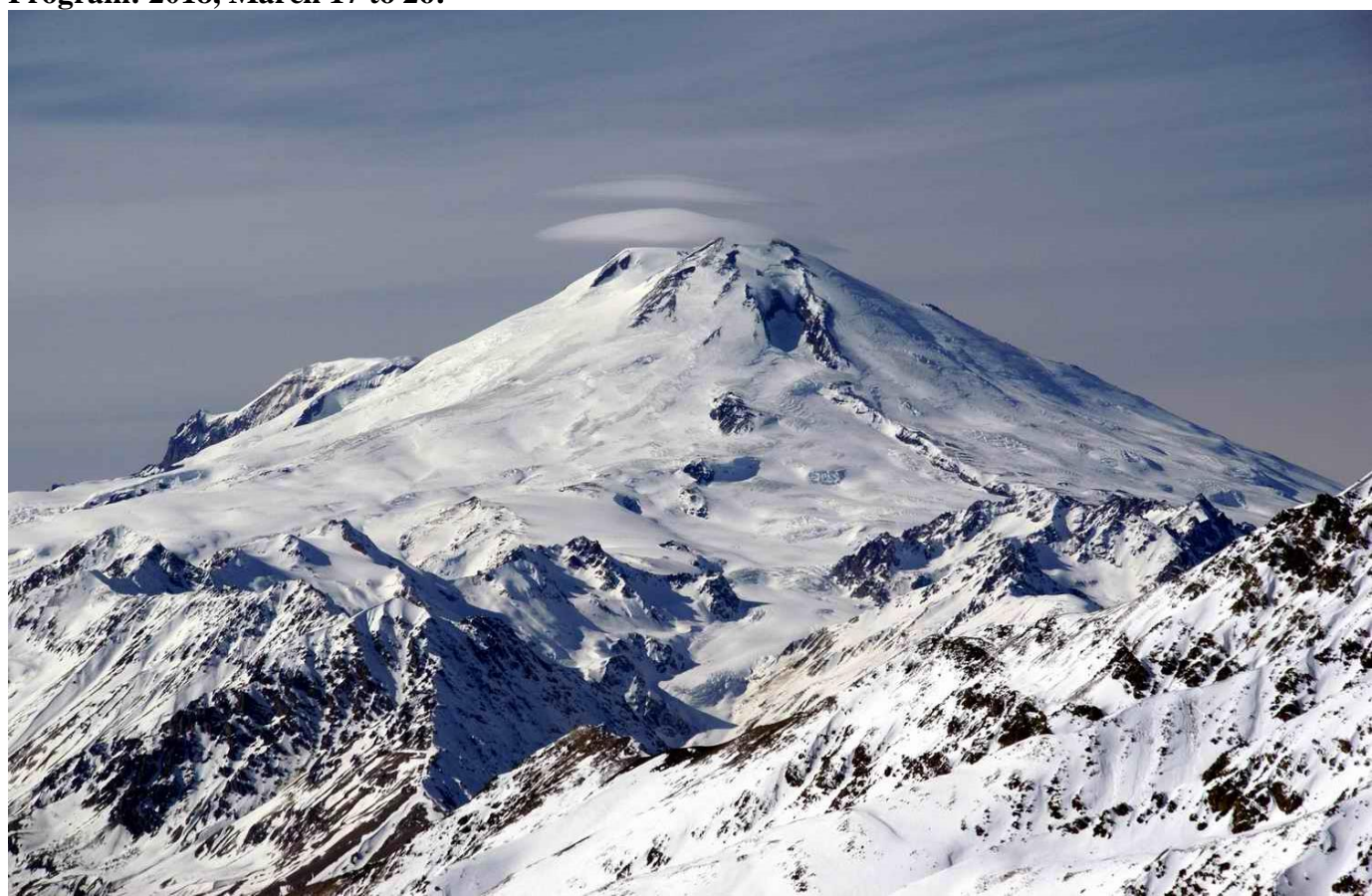
Elbrus from Gumachi top