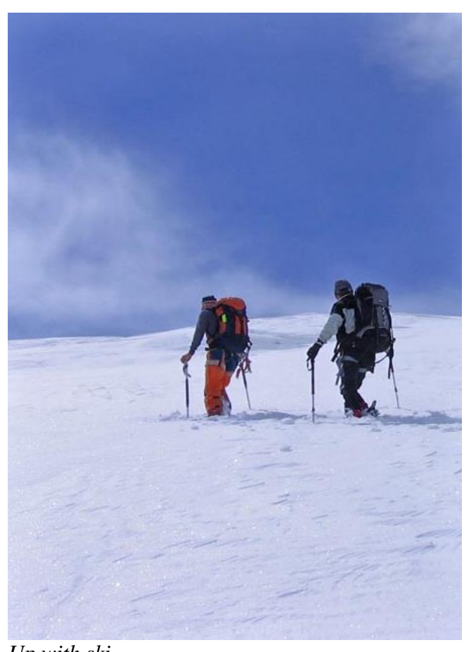
Day 4, 20/03 Ski tour to the pass Donkin, 4073m, under the highest peak of the Adyrsu ridge – peak Dzhaylyk, 4533m. Descent to the hut Ullutau.