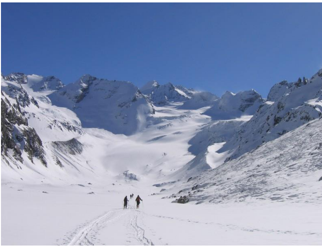
Green Hotel Meadow, now it is white!